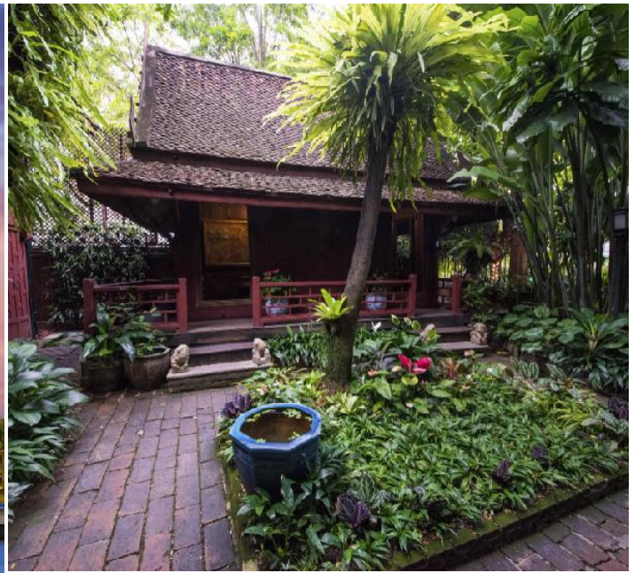
Ruen Thai Jim Thompson