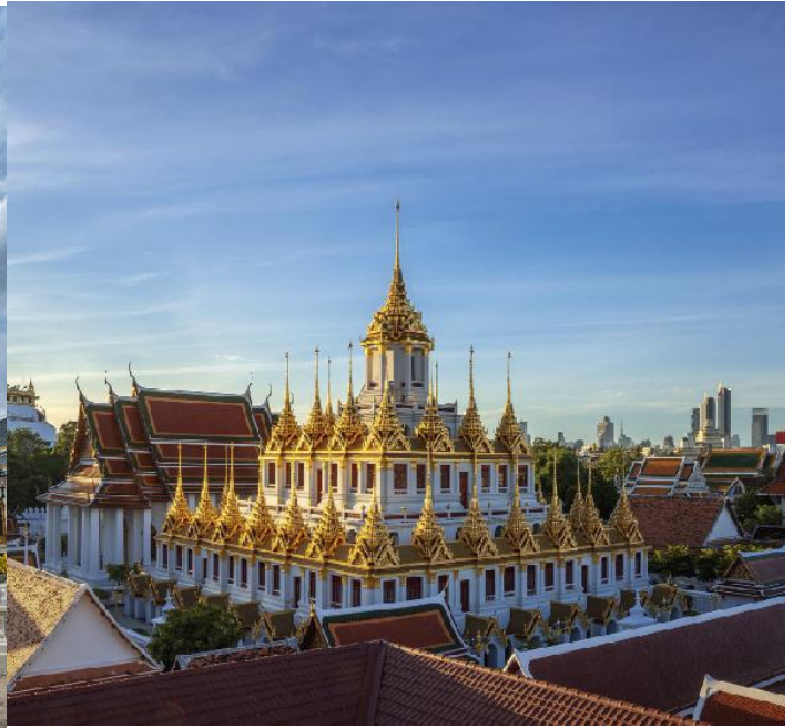
Wat Phra Kaew